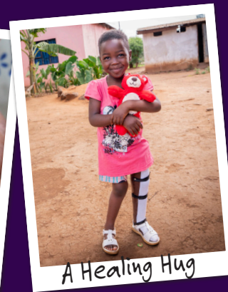
A Healing Hug

Because of you, a child who was full of hurt and despair now laughs with friends and believes in their own value. Because of you, a child who was living in constant pain now runs without a second thought. Because of you, a child who was facing a lifetime of needless blindness can now see!