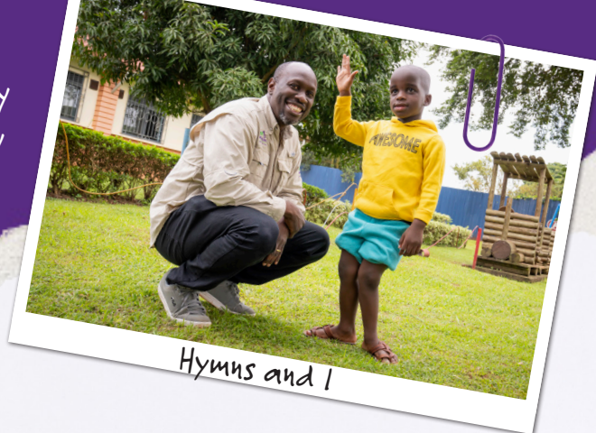
Hymns and I

I was inspired by Hymns' positivity and resilience!